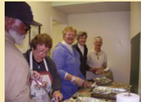
Our Bernardine Franciscan Sisters from Reading, PA provide brunch for our clients