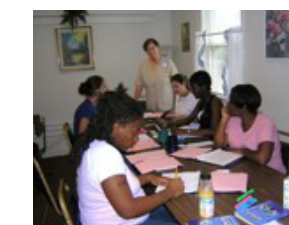
SuperCupboard program of 2003 offers low-income women with children opportunities to learn efficient and diverse ways to prepare food pantry foods, to budget carefully when shopping, as well as to enhance life skills for improved self-sufficiency.