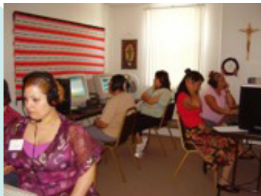
Spring 2008 expansion of the computer lab enhanced with English-Spanish programming helped with ESL and the "Latina" SuperCupboard - gratitude to Connelly Foundation