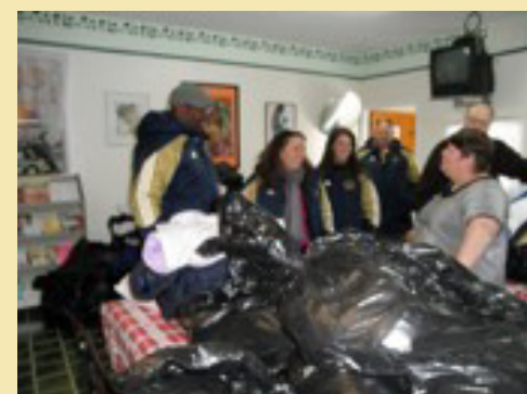
The Philadelphia Union soccer team, SEPA Soccer Hall of Fame, Sons of Ben and Caldwell Bankers donate 200 coats for clients at Bernardine Center