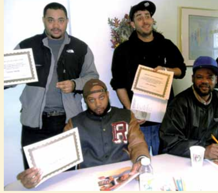
Participants in a spring 2013 Anger Management Class display