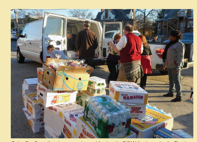
Delco City Council and partners donated food to the DIFAN food pantries for Thanksgiving 2015; BC's van was filled with 2,704.7 pounds of food, including fresh produce