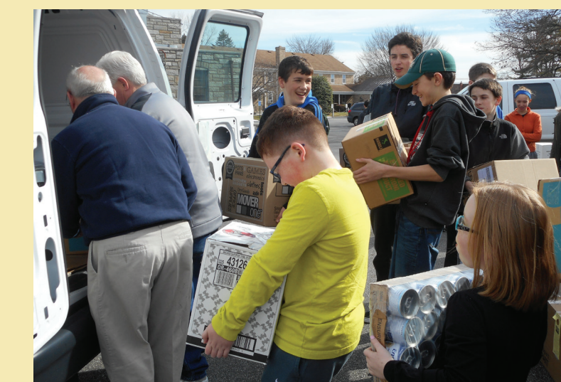
Parishioners from St. Francis of Assisi Parish load the Bernardine Center van with cases of food donations gathered during the "Souper Bowl of Caring" collection of 5,671 pounds of food in February 2016