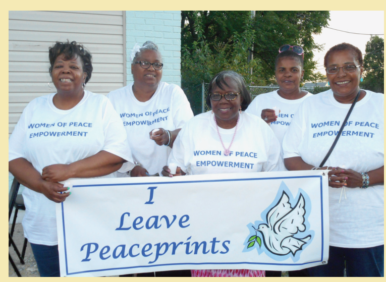
A gathering of BC's Women of Peace Empowerment before the planned vigil for International Day of Peace - September 21, 2015