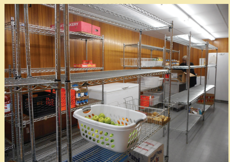
BC pantry shelves are empty after food distribution on December 23, 2015 due to so many seeking help