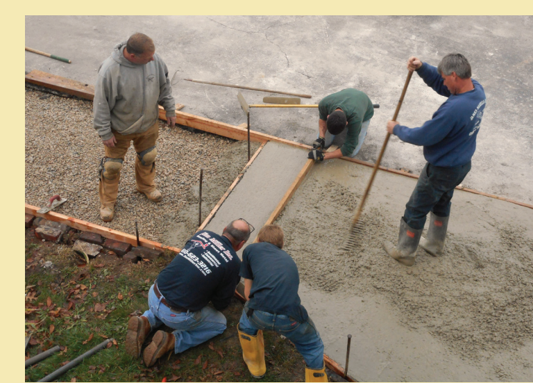
Nasella Construction Company, Inc. did the hard work of demolishing the old sidewalk and installing the new, safer walkway for Bernardine Center