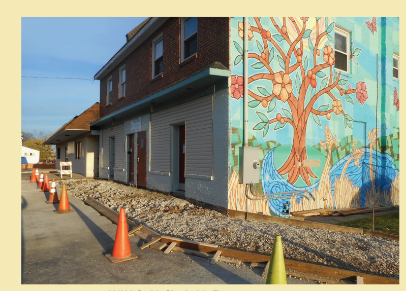
Grant funding from W.W. Smith Charitable Trust enabled BC to have a new sidewalk put in for safety of its customers