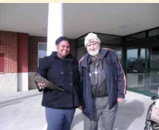
"It's perfect. Thank you for your service and God bless."