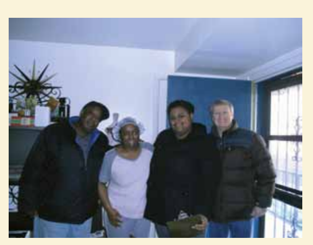
'I'm very grateful. I've been with you guys for 9 years and I'm so thankful that you help me.'