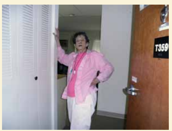
Thank you for my guardian angels.'