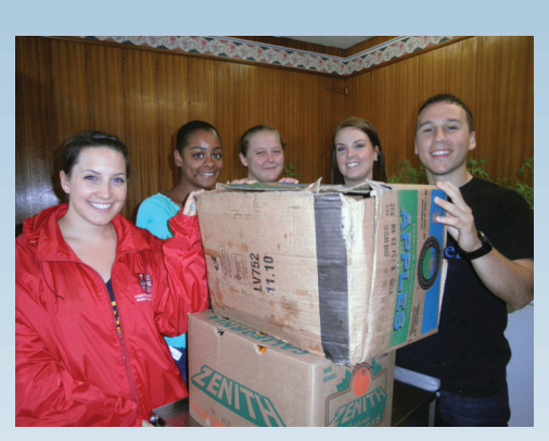
Widener University students donate fresh produce for a food distribution day.