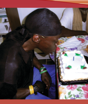
A client celebrates his birthday during West Side Brunch.