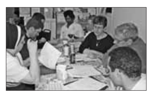
On March 27, 2008, volunteers and staff here at the BC study methods of disaster preparedness offered by American Red Cross staff.

What would you do if another disaster like Hurricane Katrina, a tornado or even a terrorist attack occurred right here in your own neighborhood?